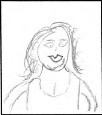
Here's a picture of me!