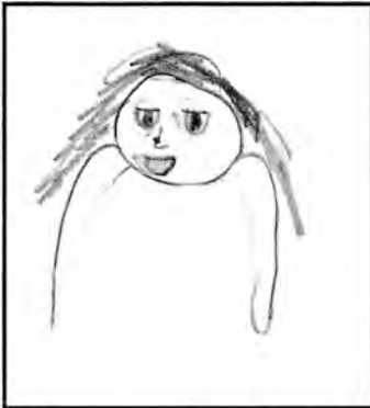
Here's a picture of me!