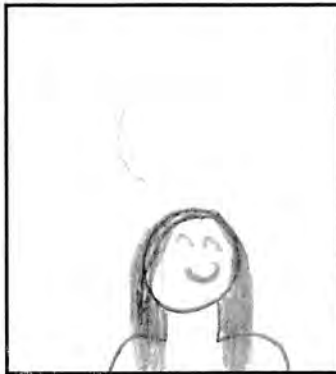
Here's a picture of me!